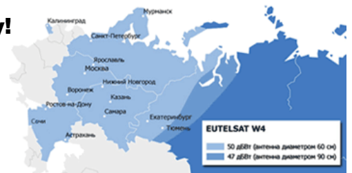
photo: Tricolor signal range