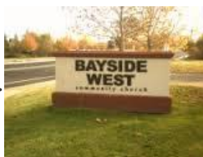
Bayside West campus>