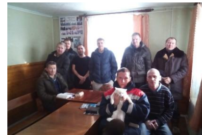
NLR listeners in Syktyvkar

Far North, to the region around Syktyvkar, where numerous Russian prisons are located. There are no Christian stations on the air and no Internet. NLR works alongside various Christian operated rehabilitation centers for recently-released prisoners. CRFR donors provide funds to install a satellite system and audio speakers that feed residents with the Word of God and keep them listening throughout the day. Contact CRFR if you would like to sponsor a system for a rehab center.