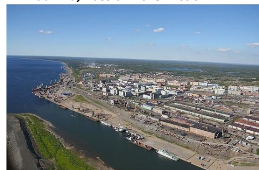
Dudinka, Russia in the Arctic

Proposed NLR satellite coverage on Yamal 401